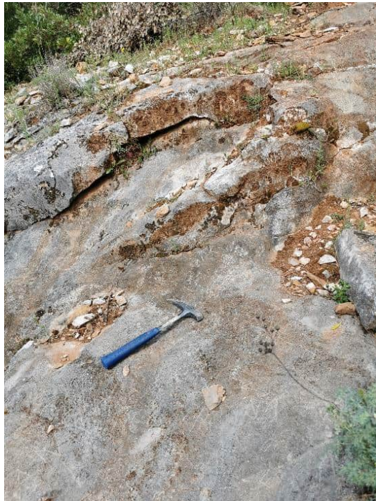
Pinkish grey dolomite, roughly stratified with reddish altered surfaces.

Outcrop along the western side of 117 path, locality “Il Sugherone”, at the head of the valley.